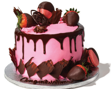
Strawberry Covered Chocolate 93663