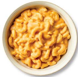
Publix Deli Macaroni & Cheese 11996