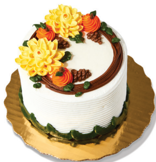
Give Thanks Thanksgiving