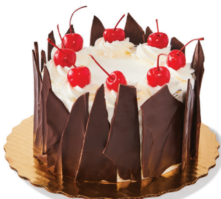
Black Forest Cherry Cake