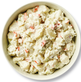
Publix Deli New York-Style Potato Salad 72645