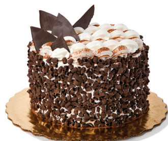
Tiramisu Delight 79876