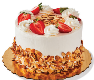
Vanilla Almond Cream Cake 95222