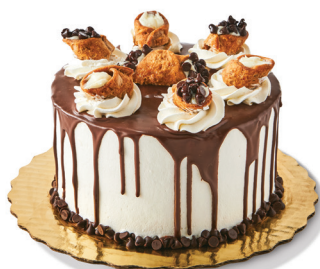
Cannoli Supreme Cake