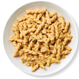
Publix Deli Hatch Chile Mac & Cheese 2451