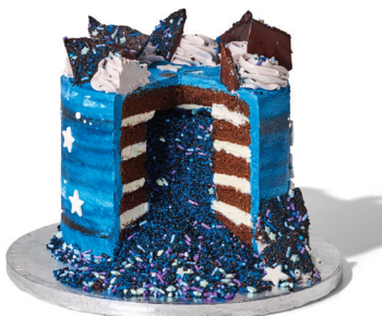
Blue Stardust* 64141