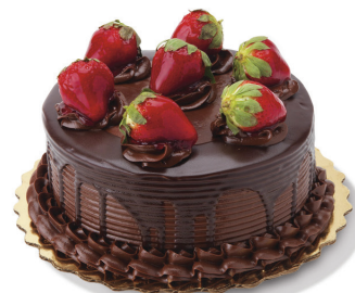
Chocolate Lovers Delight Cake 19496