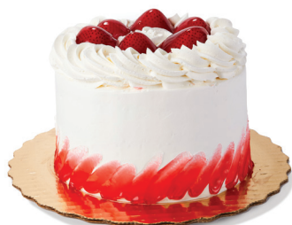
Strawberry and Cream Supreme 76346