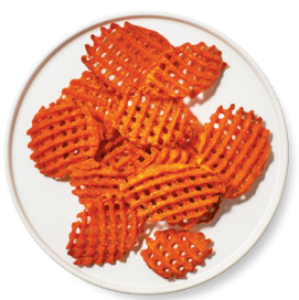
Publix Deli Sweet Potato Waffle Fries 99223