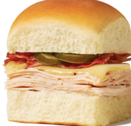
Boar's Head® Jalapeño Popper Chicken Sliders Hot Hot and ready to eat.

Hawaiian rolls, Boar's Head® Rotisserie Chicken Breast, Boar's Head® Monterey Jack Cheese, Boar's Head® Havarti Cheese, Boar's Head® Bacon, and pickled jalapeños.