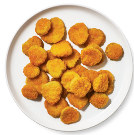
Publix Deli Fried Pickles 90068