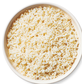
Publix Deli White Rice 97607