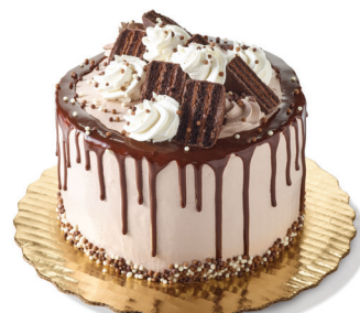
Chocolate and Cream Supreme 19723