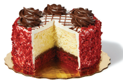
Red Velvet Cheesecake 95826