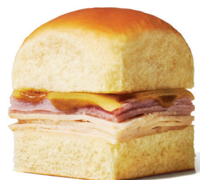
Boar's Head® Cordon Bleu Sliders Hot Hot and ready to eat.

Hawaiian rolls, Boar's Head® Rotisserie Chicken Breast, Boar's Head® Tavern Ham, Boar's Head® Mild Swiss Cheese, and Boar's Head® Honey Mustard.