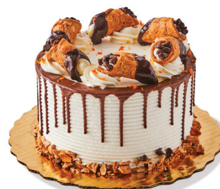
Orange Cannoli Supreme