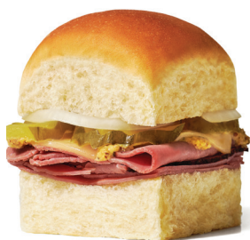
Boar's Head® Pastrami Sliders Hot Hot and ready to eat.

Hawaiian rolls, Boar's Head® Top Round Pastrami, Boar's Head® Havarti Cheese, Boar's Head® dill pickles, sliced onions, and Boar's Head® Deli Mustard.