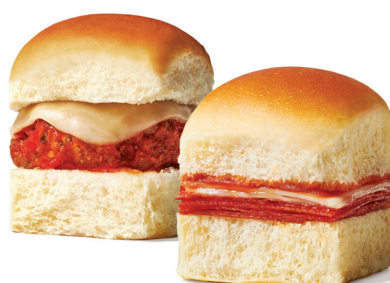
Publix Deli Pepperoni Pizza Sliders Hot Hot and ready to eat. Kid-friendly.

Hawaiian rolls, Boar's Head® Pepperoni, mozzarella cheese, and marinara sauce.