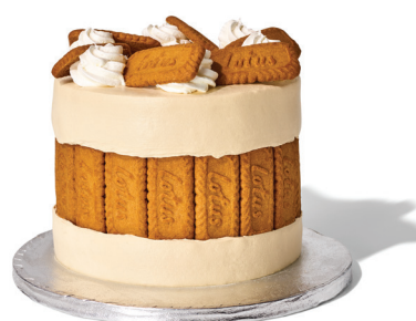
Cookie Butter Lover 48985