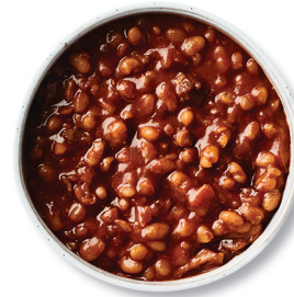
Publix Deli Smokehouse Baked Beans 97863