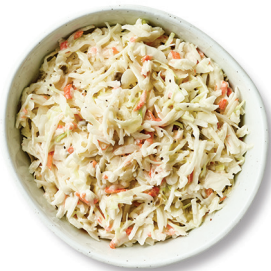
Publix Deli Shredded Coleslaw 72529