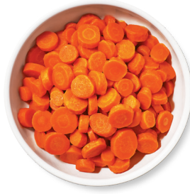
Publix Deli Carrots 71858