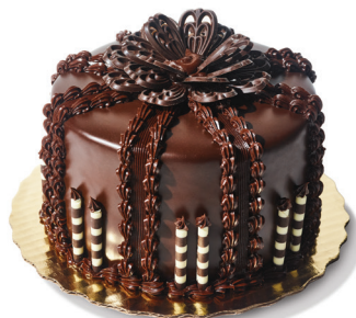
Chocolate Ganache Supreme Cake 94085