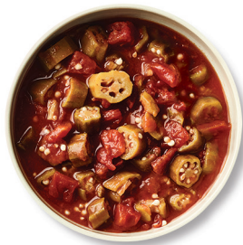
Publix Deli Okra & Tomatoes 97583