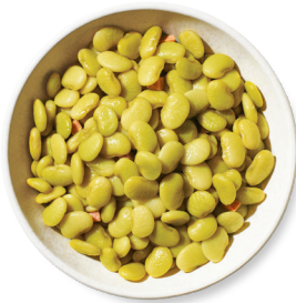
Publix Deli Lima Beans 97550