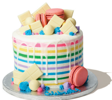
Rainbow Celebration 91297