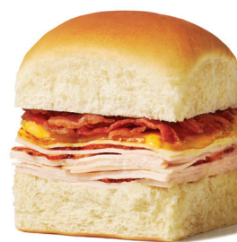
Boar's Head® Buffalo Sliders Hot Hot and ready to eat.

Hawaiian rolls, Boar's Head® Buffalo Chicken Breast, Boar's Head® Muenster Cheese, Boar's Head® Bacon, and Buffalo ranch dressing.