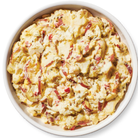
Publix Deli Homestyle Red Potato Salad 72528