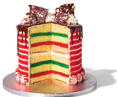
Candy Bark Dreams 48984