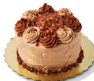
Caramel Apple Pecan Cake