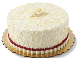
Raspberry Elegance Cake 16479