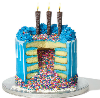
Birthday Sprinkle Explosion* 96500