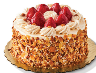
Strawberry Dulce De Leche