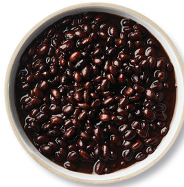
Publix Deli Black Beans 97606