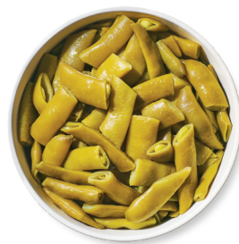
Publix Deli Green Beans 97514