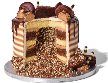
Chocolate Crisp* 85810