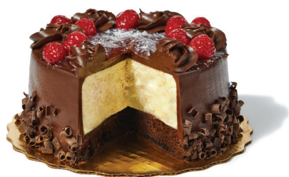
Chocolate Raspberry Cheesecake 77674