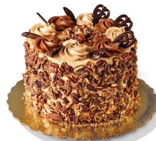
Caramel Pecan Crunch Cake