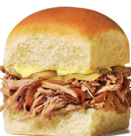
Publix Deli Cuban-Style Mojo Pork Sliders Hot Hot and ready to eat.

Hawaiian rolls, mojo pork with onions, Swiss cheese, and mayo/mustard mix.