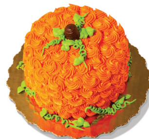
Rosette Pumpkin Halloween