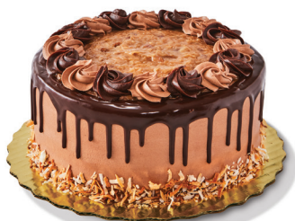
German Chocolate Delight