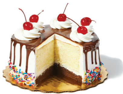
Chocolate Sundae Cheesecake 95334