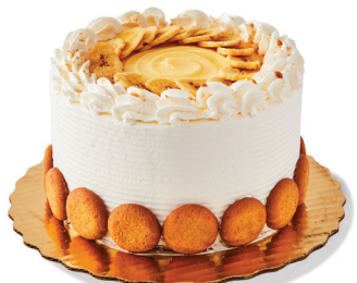
Banana Pudding Cake