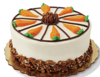
Carrot Torte Cake 19493