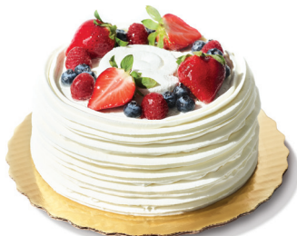
Chantilly Cake 85054