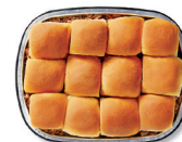
Mini Platter (Hot) 5 Servings