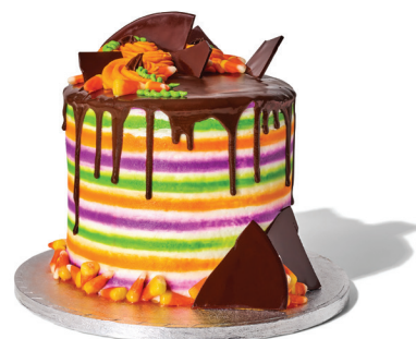
Fall-oween Dream 48981