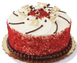
Southern Style Red Velvet Cake 71646