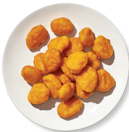
Publix Deli Corn Nuggets 92268