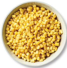
Publix Deli Niblet Corn 97590