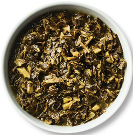
Publix Deli Collard Greens 97579