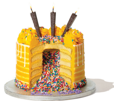
Striped Sprinkle Sensation* 97270