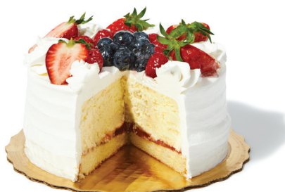
Mixed Berry Cheesecake 95325