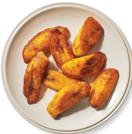
Publix Deli Plantains 90360