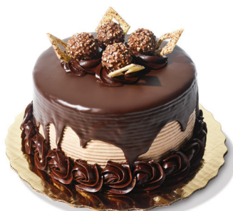
Hazelnut Indulgence Cake Made with Nutella 93539