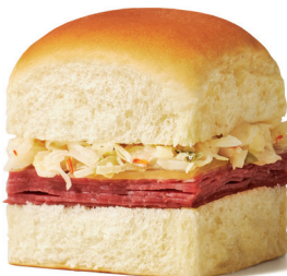
Boar's Head® Reuben Sliders Hot Hot and ready to eat.

Hawaiian rolls, Boar's Head® Corned Beef, Boar's Head® Mild Swiss Cheese, Boar's Head® Sauerkraut, and 1000 Island Dressing.