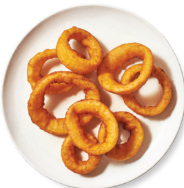
Publix Deli Onion Rings 98634