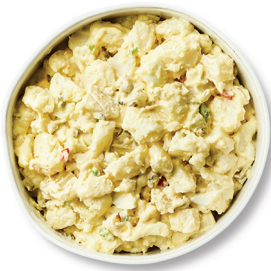
Publix Deli Southern-Style Potato Salad 72526