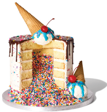
Sundae Fundae* 69621