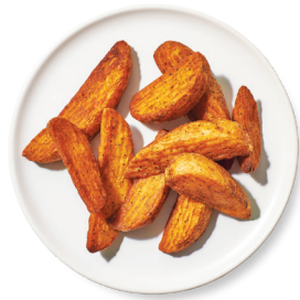
Publix Deli Seasoned Potato Wedges 97716