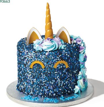
Celestial Unicorn* 97251