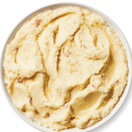
Publix Deli Mashed Potatoes 97598