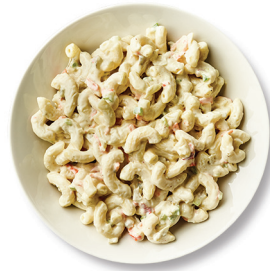
Publix Deli Macaroni Salad 72537