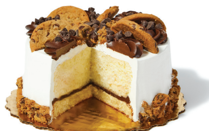
Chocolate Chip Crumble Cheesecake 94768