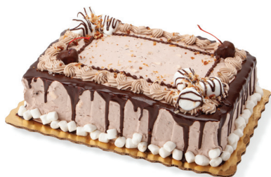
Rocky Road Dream