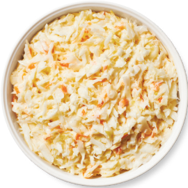
Publix Deli Sweet Coleslaw 72530