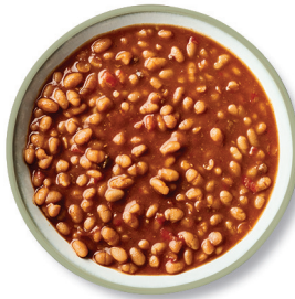
Publix Deli Old Fashioned Baked Beans 97879