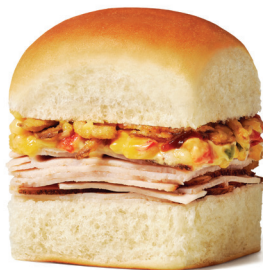
Boar's Head® PitCraft® Turkey Sliders Hot Hot and ready to eat.

Hawaiian rolls, Boar's Head® PitCraft® Turkey, Publix Cheddar Jack Cheese Spread, Boar's Head® BBQ Sauce, and crispy onions.