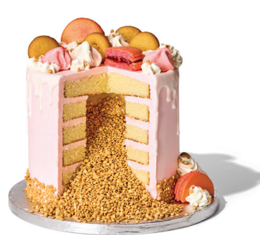
Pink Party* 48987