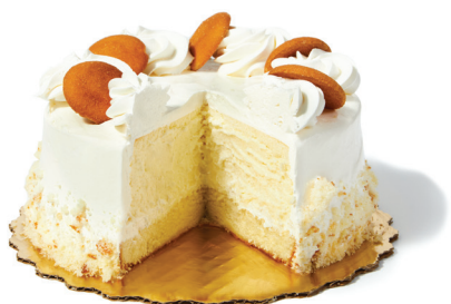
Banana Cream Cheesecake 95322