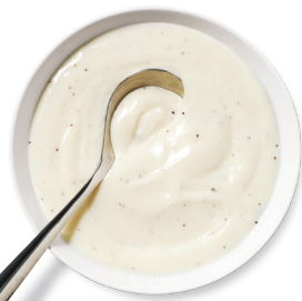
Publix Deli White Gravy 97616