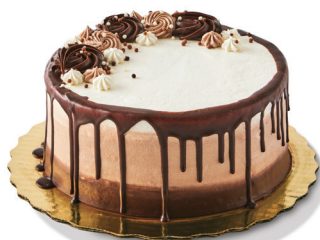
Chocolate Red Velvet