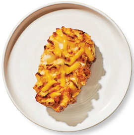
Publix Deli Loaded Twice Baked Potato 2693