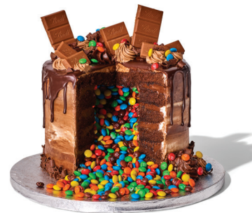
Chocolate Abundance* 96595