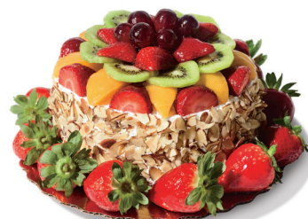
Strawberry & Peach Sensation Cake 94137