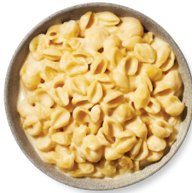
Publix Deli Cheddar-Gouda Mac & Cheese 96601