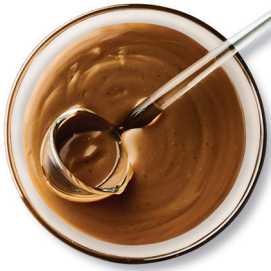
Publix Deli Brown Gravy 97616