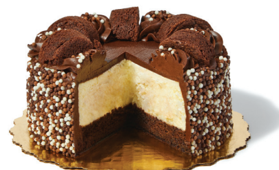
Brownie Crunch Cheesecake 92475