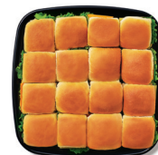
Small Platter (Fresh-chilled) 10 Servings