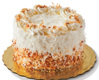
Coconut Custard Delight