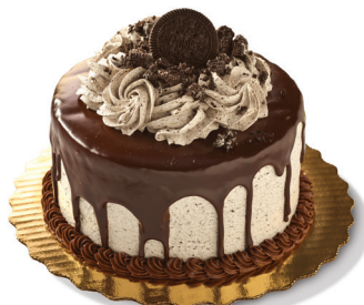
Cookies & Cream Mousse Cake

Serves 6-10. Also available in 1/4 and 1/2 sheets.