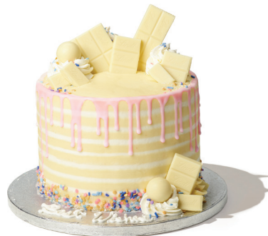
Vanilla Wonderment 94944