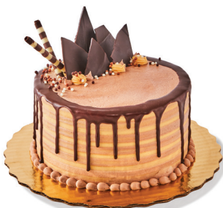
"I Heart Peanut Butter" Cake