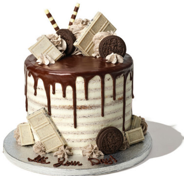
Cookies & Cream Hero 97253