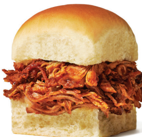
Publix Deli Smoked Pulled Pork Sliders Hot Hot and ready to eat.

Hawaiian rolls, smoked pulled pork, and Traditional Sweet and Spicy barbecue sauce.